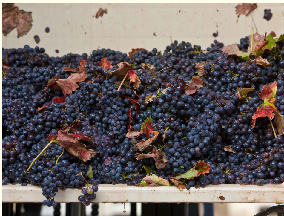
Top-selling red wines by volume are Cabernet Sauvignon, Red Blends, Pinot Noir and Merlot, according to Nielsen-measured U.S. off-premise sales.

“It was a compacted harvest for the Cabernet Sauvignon, coming in right on top of the large crop of Chardonnay, so tank space was at a premium,” he continued. “Labor was tight, but we managed it by scheduling far in advance.”