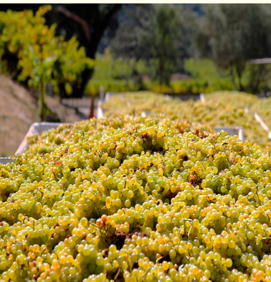
Ever-popular Chardonnay remains the number one winegrape variety in the state.